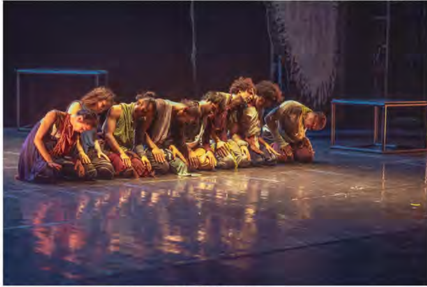
من عرض فرقة أنيكايا في رام الله

ونظمت سرية رام الله الأولى، في الفترة الواقعة ما بين 15 و22 حزيران، الدورة السابعة عشرة لمهرجان رام الله للرقص للعاصر، ويأتي هذا التنظيم بالتزامن مع إحياء الذكرى الخامسة والسبعين للنكبة الفلسطينية، حيث شاركت حوالي 15 فرقة وفنانا من بينهم خمس فرق أجنبية تبنت إحداها رقصة مؤتمر الطيور. وافتتح للمهرجان مع "حلم لوسيد" لفرقة "مازيل فريتن" الفرنسية، واختتم بنجاح مع فرقة E الأمريكية وفرقة سرية رام الله الأولى الفلسطينية بعمل مشترك تحت عنوان: أرى/لا أرى. ويأتي هذا المهرجان الذي استضاف نخبة من مصممي الرقص المعاصر، والفرق الدولية والعربية والفلسطينية، ليؤكد أهمية الفنّ الذي يخلق "فضاءً تشاركيا عمومياً"، وكما يقول أنطونيو نيغري، الفيلسوف المعروف: الفنّ لا يبلغ مقام الجمال، إلّا إذا كان قادرًا على اختراع المشترك.