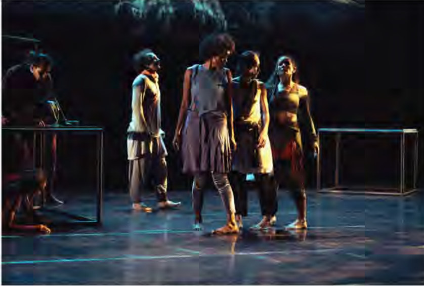
من عرض فرقة أنيكايا في رام الله

تدور قصة الشاعر الفارسي حول موضوع "الانتقال والحركة"، فرحلة "منطق الطير" هي رحلة جماعية، تنتقل فيها الطيور للوصول إلى آلهتها المنشودة "السيمرغ". وتواجه الطيور صعوبات شتى وعقبات أثناء رحلتها. كذلك الأمر، في ملحمة "طيور فرقة أنيكايا" التي تنتقل من مكانها إلى اللامكان، من البيت إلى البيت. هذا المشهد، يعود بنا، إلى باشلار الذي أطلق على بودلير صفة "الحالم بالستائر" لاعتقاده أن خلف الستائر الدائنة يبدو الثلج أكثر بياضاً، أكثر صقيفاً، ورعباً. إذ وظيفة الانتقال والحركة لدى طيور فرقة أنيكايا، تؤسس لسردية تقوم على للخيال السياسي، كونها تجسد هجر الجغرافيا القديمة الدافئة والأمنة بحثاً عن العودة أو الذات؛ ليصبح الآخر- أي الطيور- ضدّاً، كما هو الحال مع السكان الأصليين الفلسطينيين، فإذا بلسان العالم يقول: "أنا أعرف، غير أنني لا أريد أن أعرف بأنني أعرف، فلا أعرف إذاً." وهذه العبارة أوردها الفيلسوف سلافوي جيكا في كتابه المعروف "العنف: تأملات في وجوه السنة"، ليصف التزييف وإخفاء الواقع.