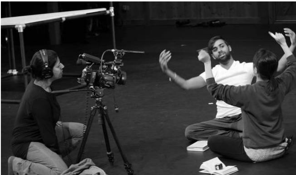
A rehearsal of 'The Conference of the Birds'.