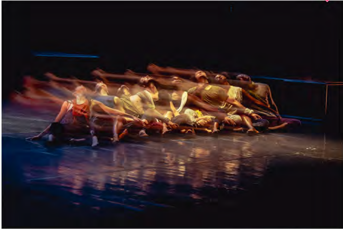
من عرض فرقة أنيكايا في رام الله